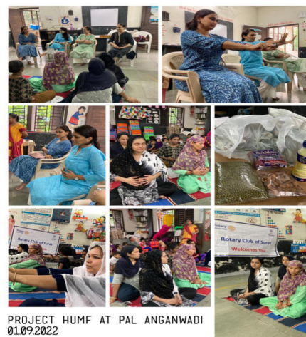
PROJECT HUMF AT PAL ANGANWADI 01.09.2022